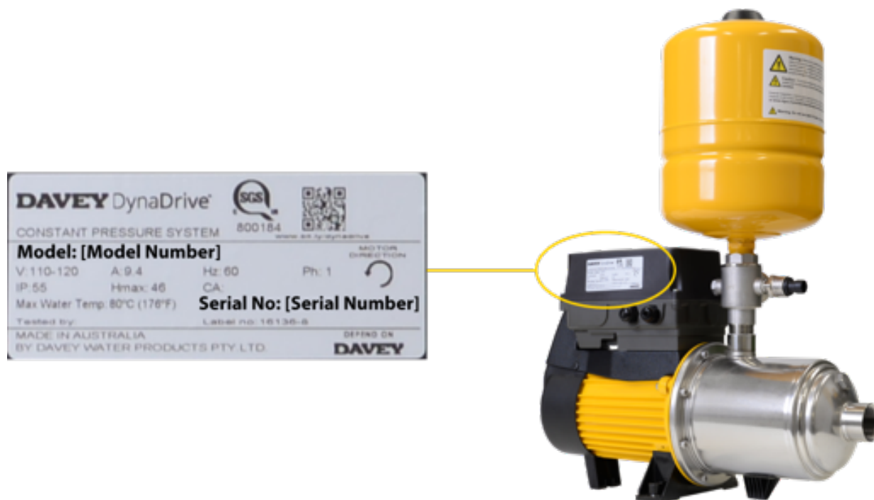
Recalled Davey DynaDrive Pump with model number location